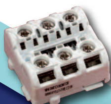
Mini-Switch Monitor with Isolator Part Number 55000-760

Our new Context Plus Mini Switch Monitor is an interface within an entirely new housing which is ideal for use in areas where space is limited. Its compact design allows the unit to be fitted onto a standard 35mm DIN-Rail (using a twist-click motion) or to be mounted within an enclosure, for example a manual call point. It is designed to monitor the state of one or more single pole, volt-free contacts connected on a single pair of cables and to report the status to Context Plus compatible addressable control equipment. The unit includes three coloured status LEDs.