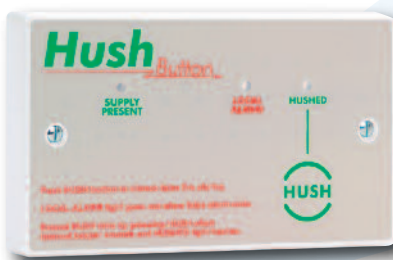
Hush Button Part Number XFP508X