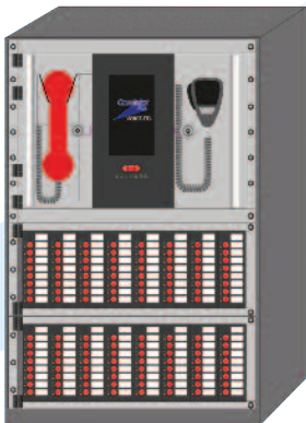
Context Plus VOICE-TEL